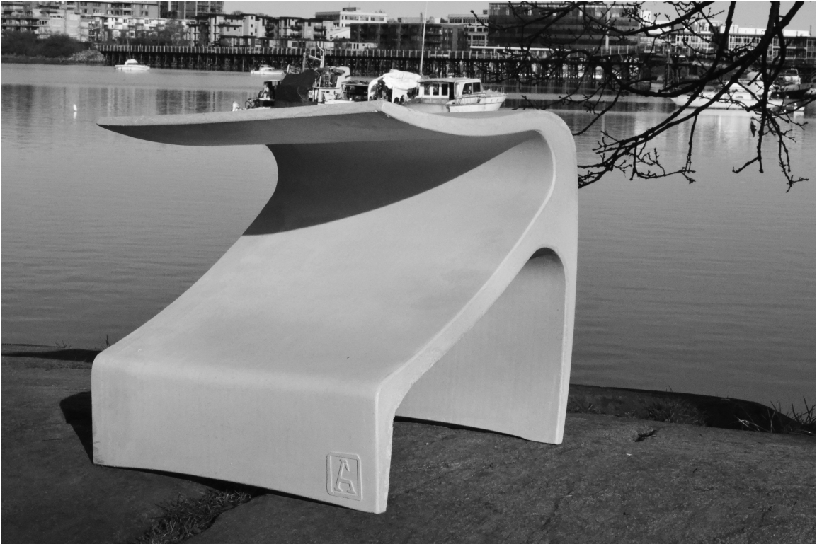
Artist proof n.1