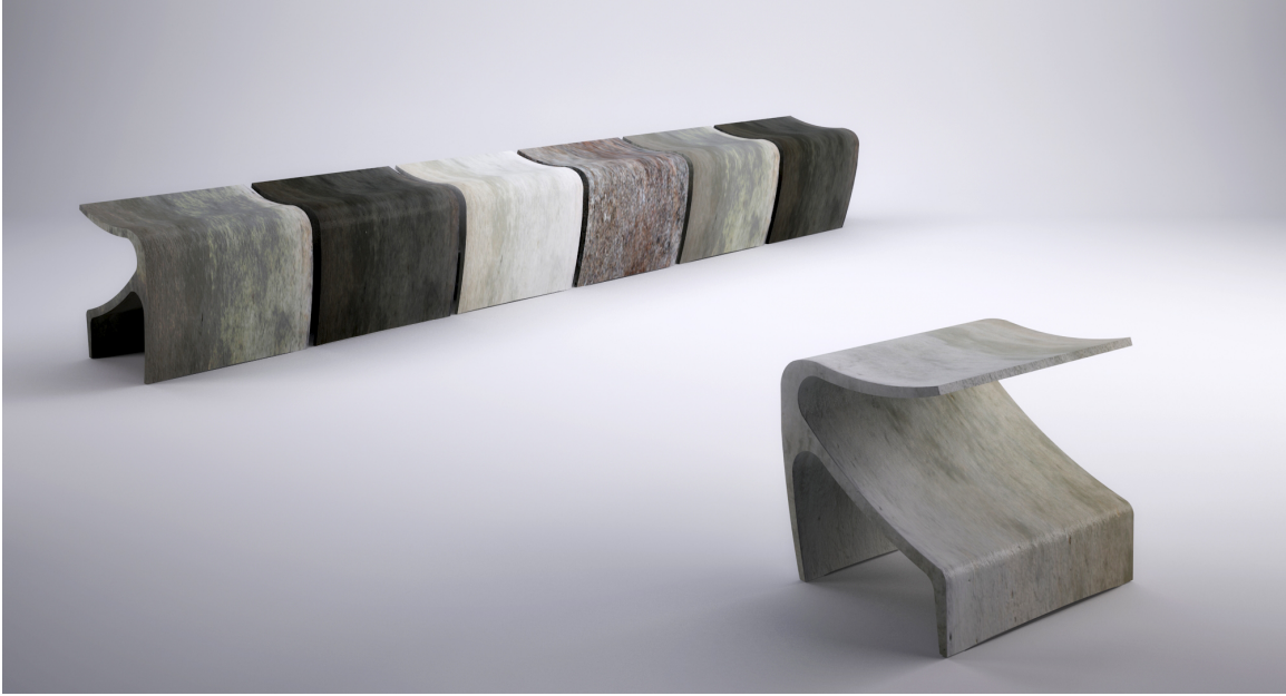
Digital rendering 3