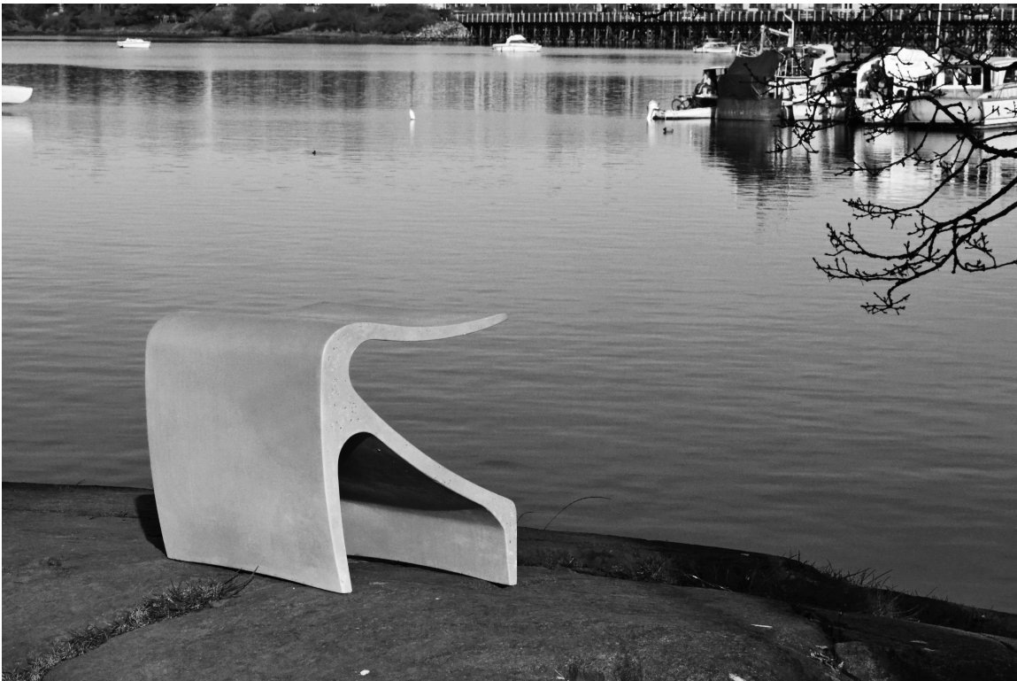
Artist proof n.1

This modular concrete bench was developed in collaboration between Arostegui Studio and Szolyd Development.