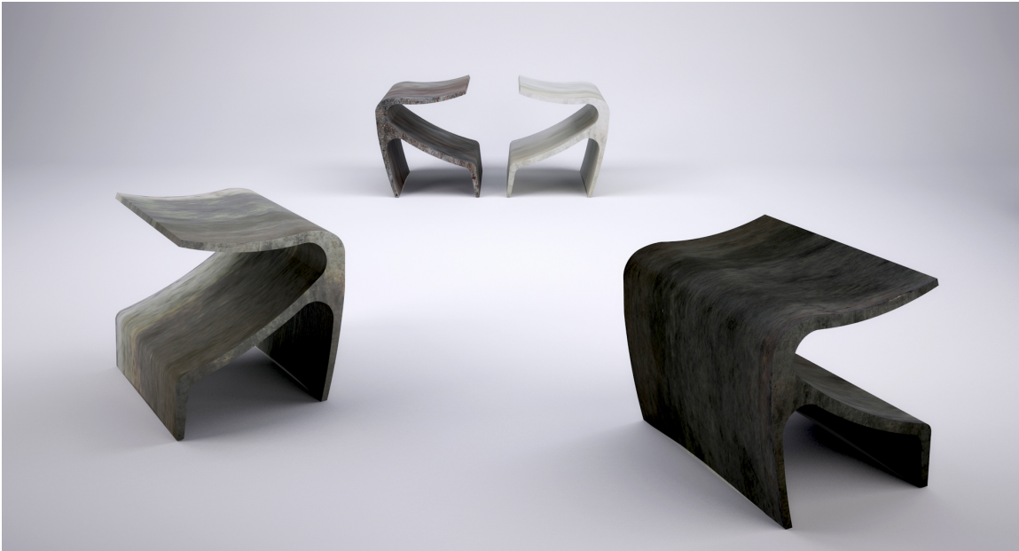
Digital rendering 2

Arostegui Studio carefully designed 'The Sofi' bench specifically with the intention to produce in concrete, with a local company employing UHPC (Ultra High Performance Concrete). This unique material is an innovative type of concrete, which is both lighter and stronger than typical concrete. This strength allowed Cristian Arostegui G. to design a refined profile, while still providing ample structural strength.